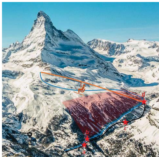
Figure 1: Zermatt's ski field beneath Matterhorn with the avalanche control area (red), the chair lift (orange), slopes (blue), the road to the hydro-power plant (black) and the people detection stations a, b, c & d (stars). The ski field extends to the left in this photo and is not plotted.

The test period at Stafel lift station was very successful and confirmed that the people detection radar is suitable for this type of application. The radar reliably detected the people on the observed road