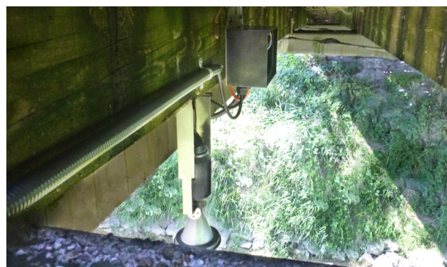
A gauge radar is mounted underneath a pedestrian bridge.