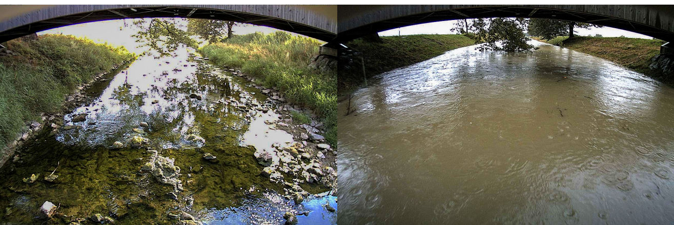
Pictures of a tributary: A small creek at low tide (left) and being filled up during a heavy precipitation event (right).