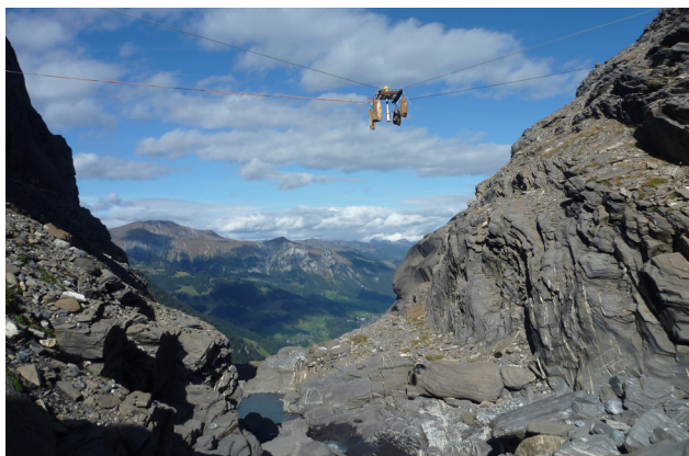
The gauge radar monitors the discharge of the glacier plateau at Trüebbach river; a tributary to the Simme, flowing to the valley village Lenk.

Webcams record lake images several times a day and transmit images and level data continuously to the Geoprevent online data portal. Authorized users can observe the lake and river status remotely anytime via PC, smartphone or tablet. Exceeding of a certain lake sink rate or river discharge level automatically triggers an alarm and immediately notifies the municipality of Lenk as well as the responsible person at the Canton of Berne.