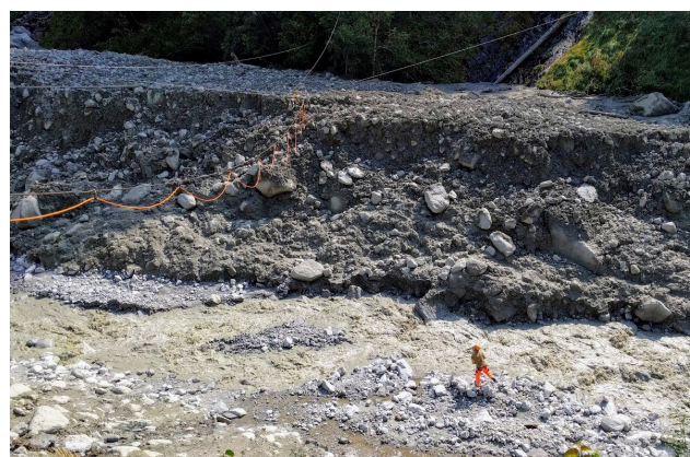
Gauge radar station (station A) across the Bondasca river with several meters debris flow deposits in August/September, 2017.