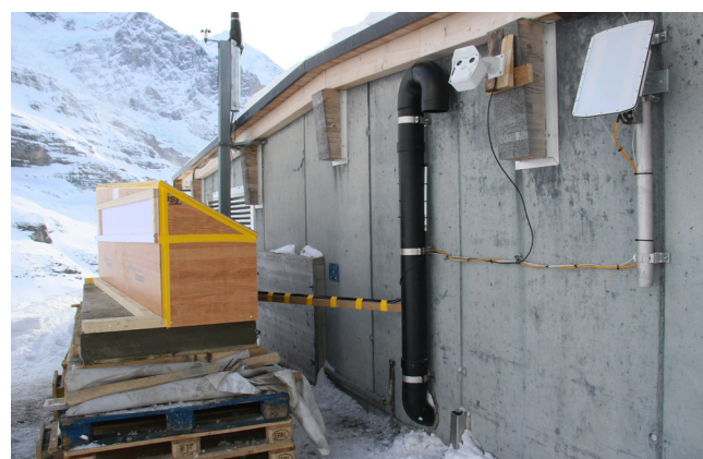
Figure 3: The interferometric radar is well protected by a wooden case. Next to it, a camera and the avalanche radar also look at the glacier.