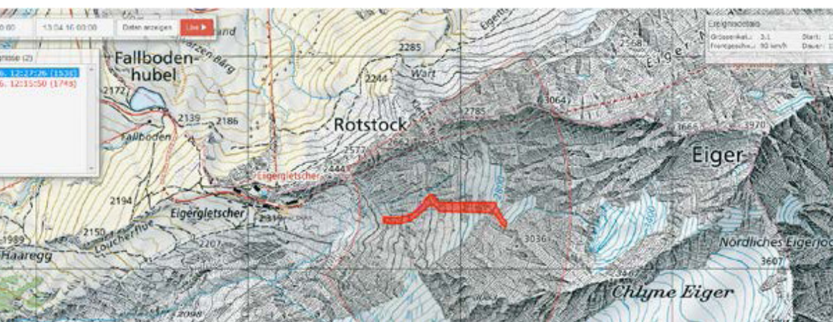
Title Page: Eiger glacier.